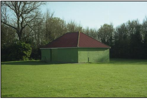
The Memorial Ground